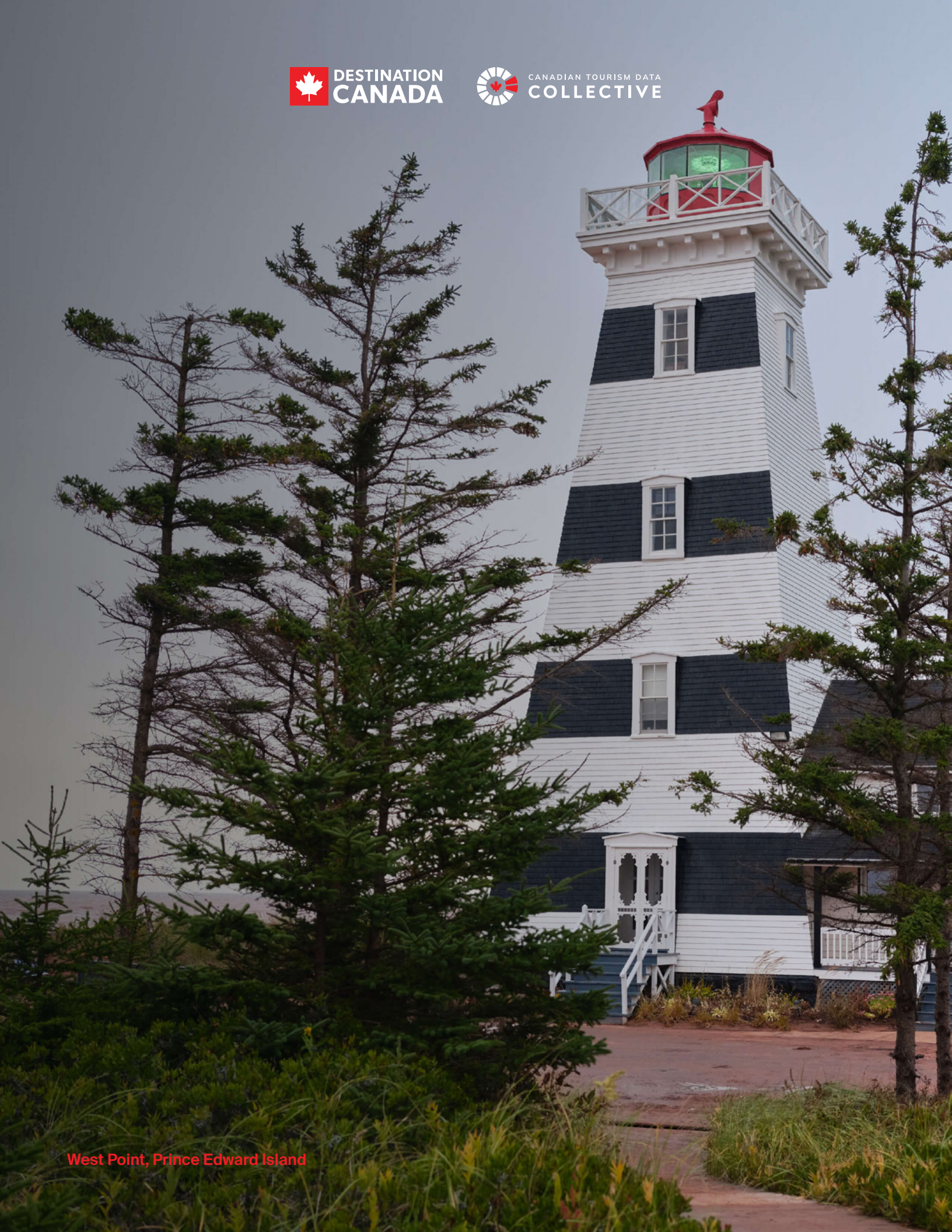
West Point, Prince Edward Island